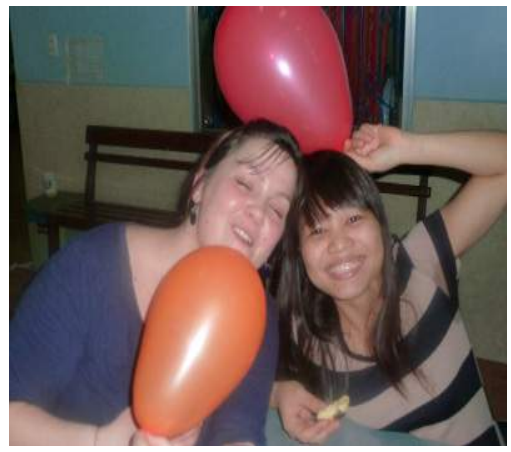
Newsletter Special Edition 20 years