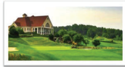
P.B. Dye's masterpiece signature course!

Maison Chance USA is pleased to invite you to our 4th annual fundraising golf outing. Come join MC Cup IV at the renowned PB Dye Golf Course on Sunday June 22, 2014. Come join us to give back and to make some great golf & fun memories!!