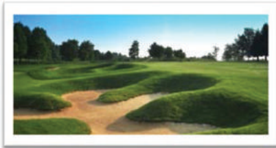
P.B. Dye's masterpiece signature course!