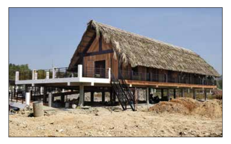
Text : Maison Chance, Photos © McFreddy

Building No. 16 on the map is under construction. It will serve as a temporary office and management room during construction. This construction is representative of the traditional ethnic minority houses that inhabit the region.