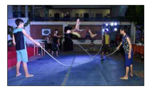
Text and photos © McFreddy