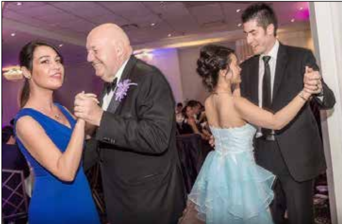
Canada, Montreal, June 2017