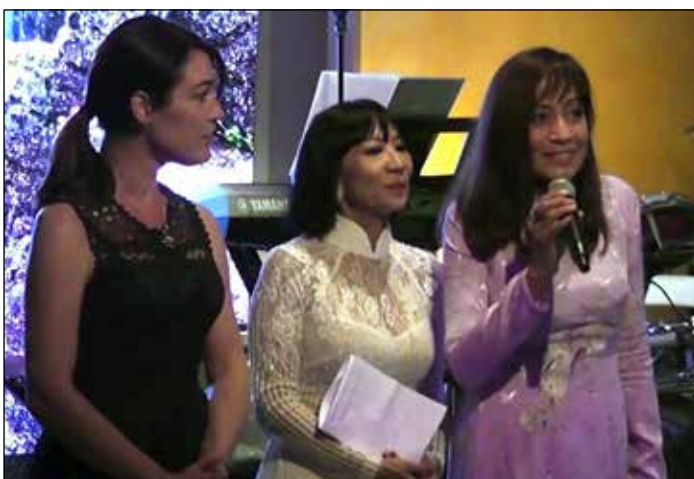
France, Paris, May 2017