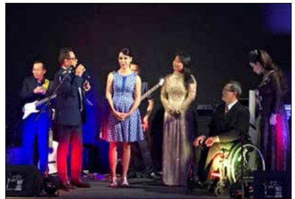
Norway, Oslo, September 2017

This international tour was successful and helped raise funds through generous donors and support from Vietnamese organizing committees and celebrities.