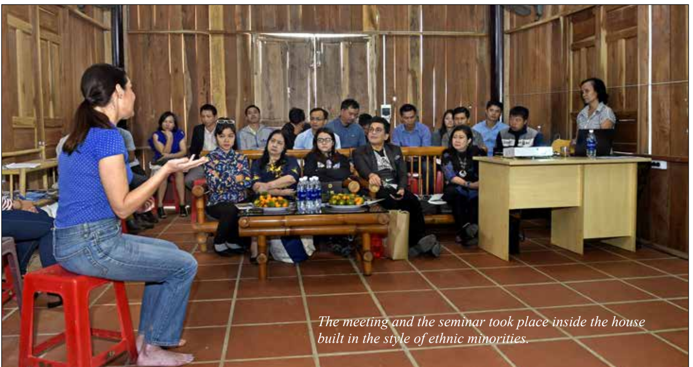
The meeting and the seminar took place inside the house built in the style of ethnic minorities.