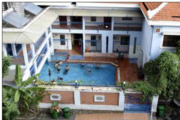
View of the pool at Village Chance