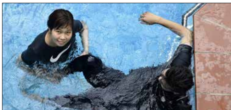
Thu, the physiotherapist with a disabled patient in the water