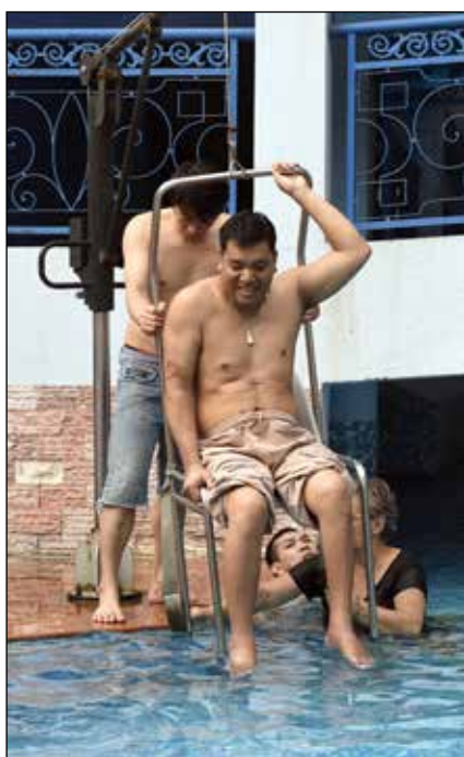
Stork used to shuttle the paralyzed in and out of the pool

What is the pool for? This is a question we can easily ask ourselves. Specially designed for aquatherapy, the pool at Village Chance is equipped with a ramp and a hoist to easily transfer the beneficiaries into the water. These therapies are a boon for people with disabilities who are then released from the weight of their bodies. This lightness allows them to perform additional exercises to their daily care. The pool is also for children.