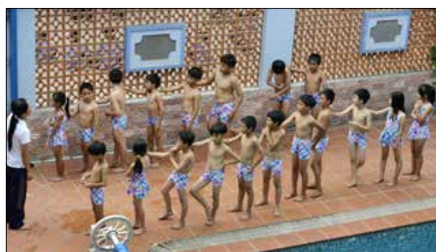
Warming up before the school children's swimming class

To mix business with pleasure, the pool is open to all members of Maison Chance, more than 500 people, including volunteers, visitors and residents of the Village.