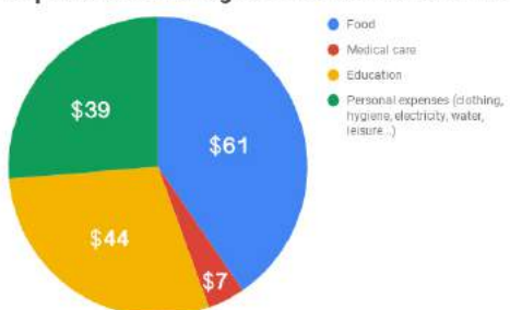
Handicapped: 360 USD/month