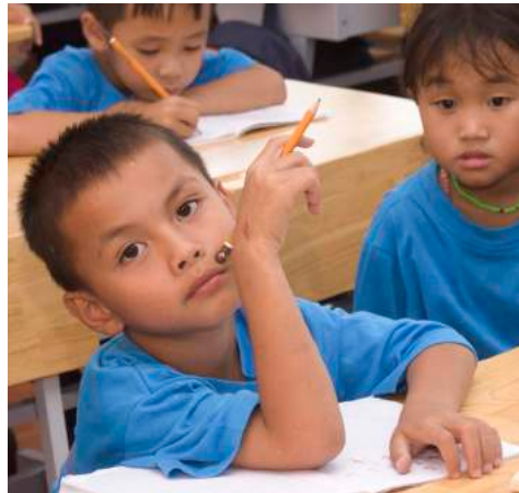
The first class.