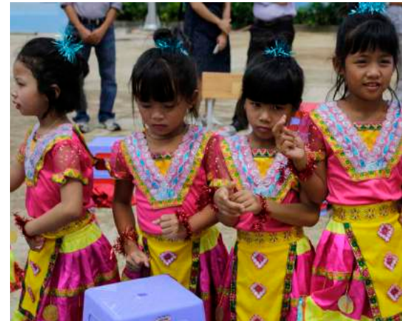
These little girls are preparing a traditional ethnic minority dance.