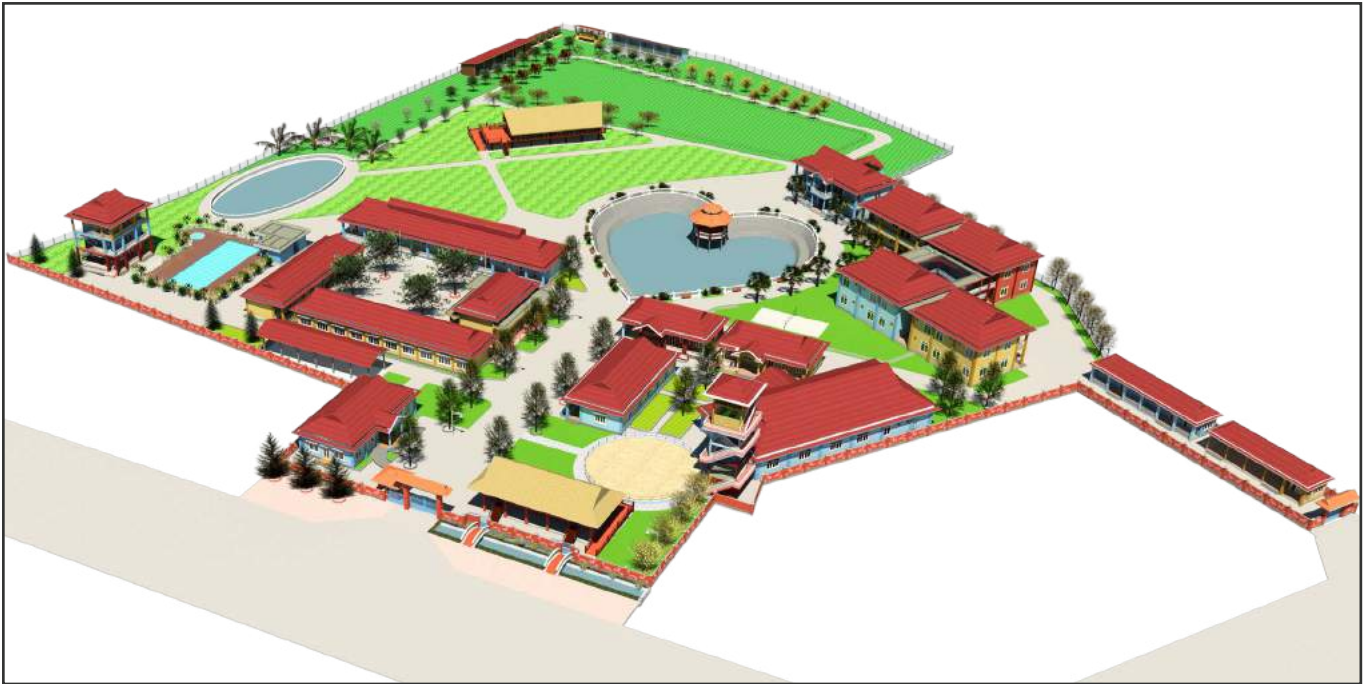
Update: Latest construction plan of Maison Chanc Social Center in Dak Nong.