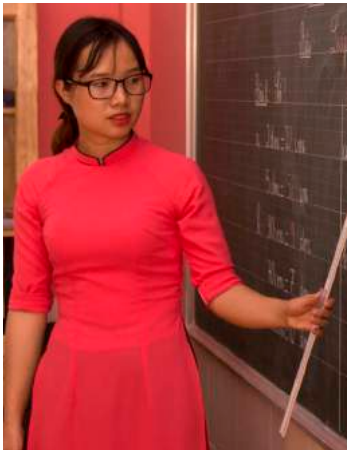
The teacher in her traditional dress, the "ao dai".