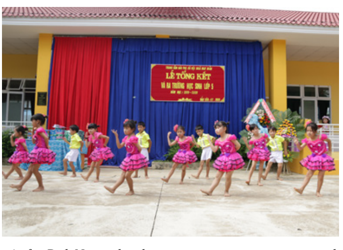
As for Dak Nong, the closing ceremony was very special because the first 5th class of the Social Center's school finished their primary studies.