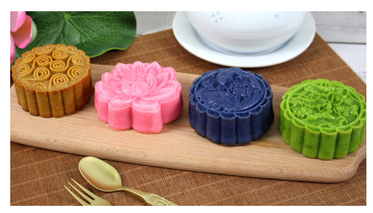
Different flavors of mooncakes.

Every year, on the occasion of the Mid-Autumn Festival, the Maison Chance bakery produces moon cakes, always prepared with fresh ingredients and without preservatives. These cakes will make a perfect gift for your families and friends.