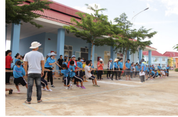
After having a small break and enjoying lemonade, they continued with the marathon, the tug-of-war with cheers and applause from classmates and teachers.