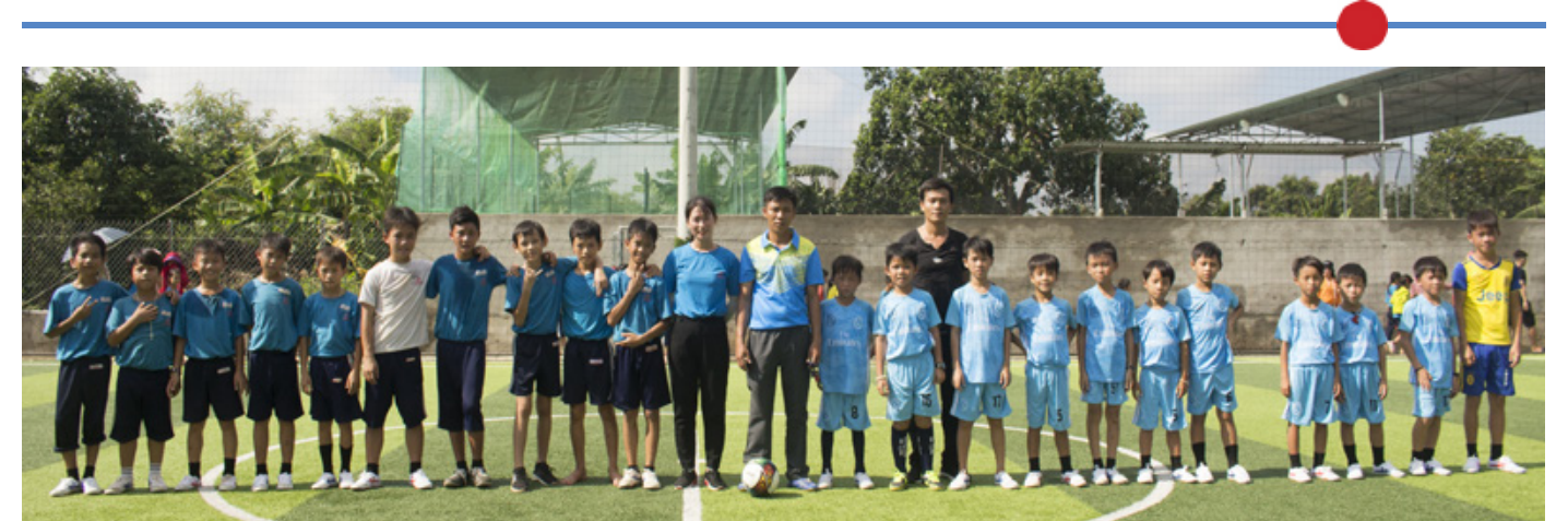
World Children's Day at Maison Chance Social Center in Dak Nong started early with a football match between 2nd and 5th grades team and 3rd and 4th grades team. A picture of two teams after the game. Winners or losers, all smiling!