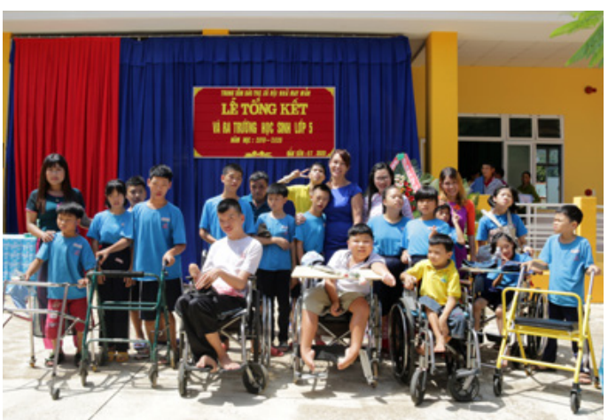
The Maison Chance scholarships were awarded to them to enable them to continue their secondary studies. Students in special classes also received gifts to congratulate them on their efforts.