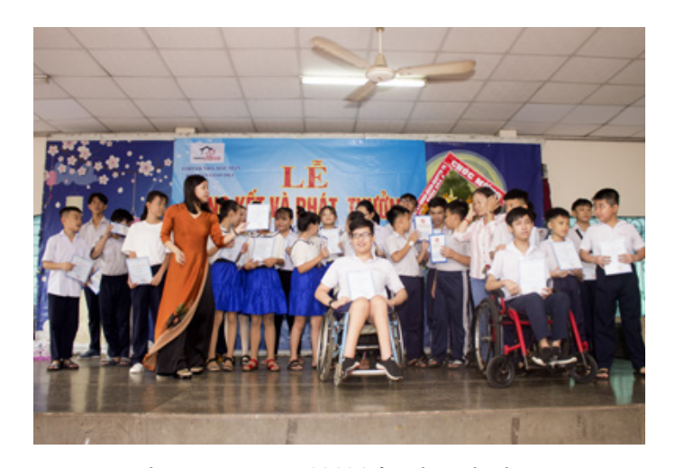
The pass rate is 100% for the 5th class.