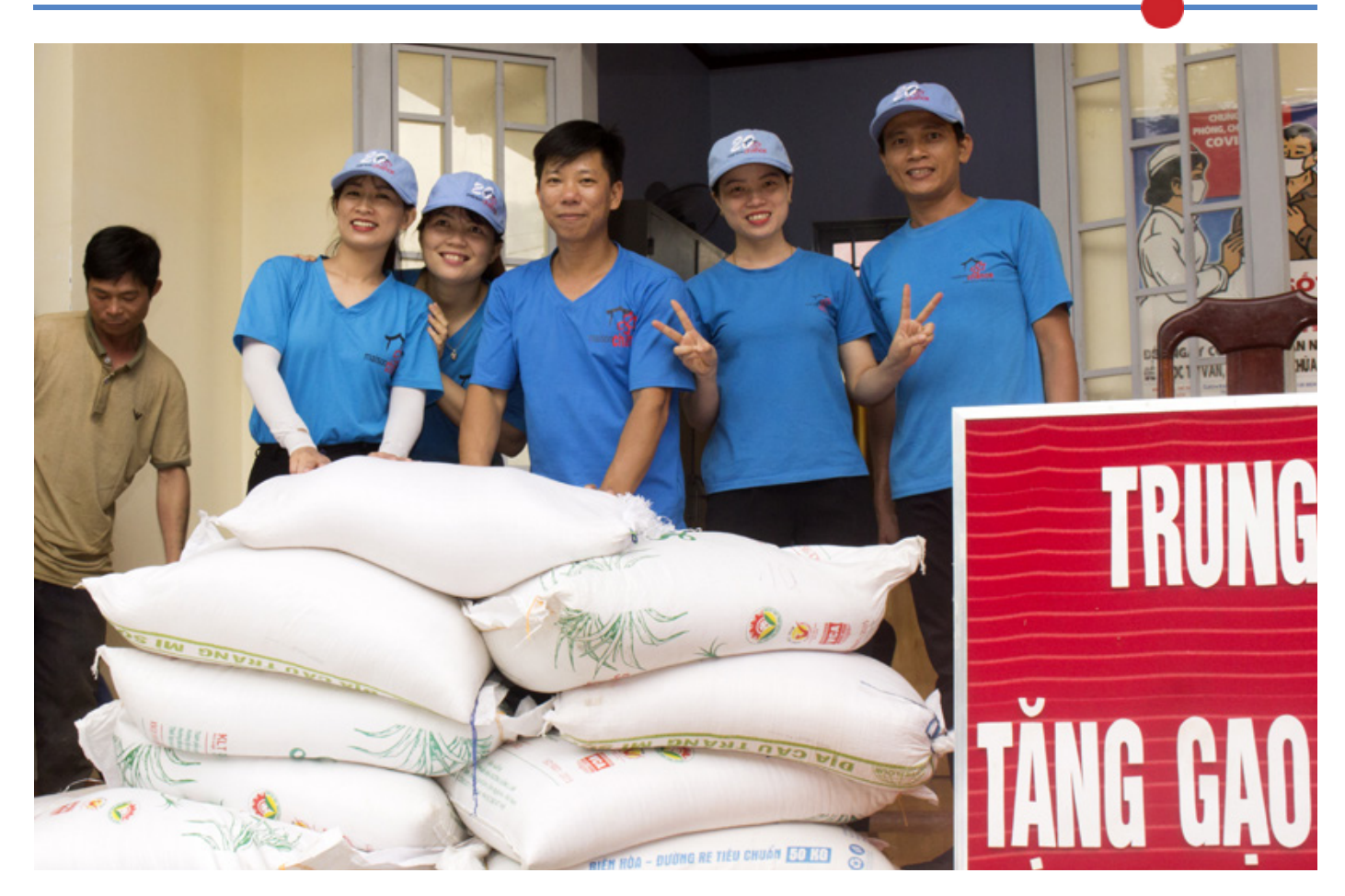
A young, dynamic and dedicated team.