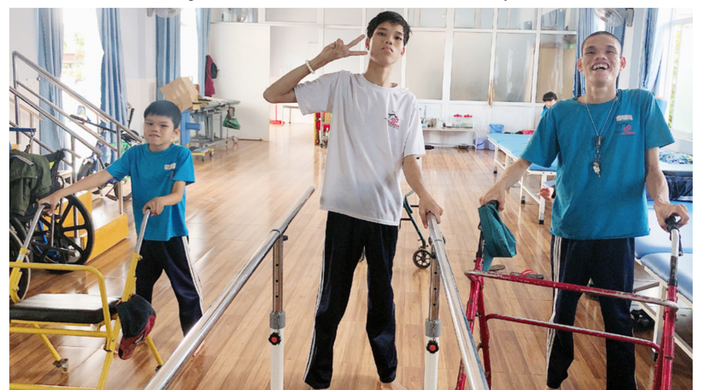
At Maison Chance, they receive their education in special classes and get adequate care.