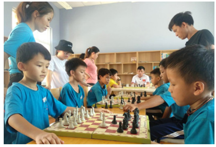
The day concluded with swimming and chess competitions.