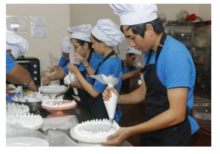
The decoration is also an essential step in baking