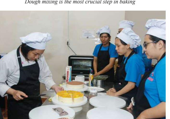
They learn to make all kinds of Speciality Cakes