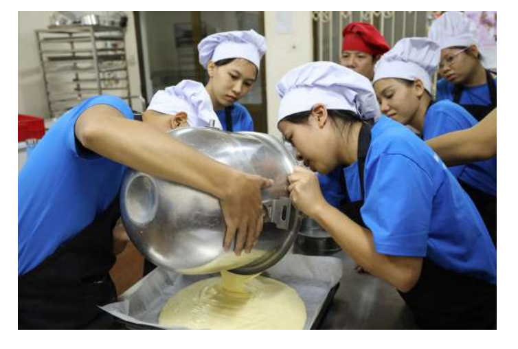
Dough mixing is the most crucial step in baking