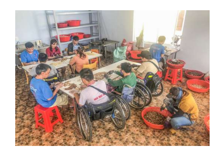
Everyone is working hard

Maison Chance Dak Nong would like to vigorously develop the cashew processing department to a bigger scale and create long term and stable jobs for all beneficiaries at the center as soon as possible.