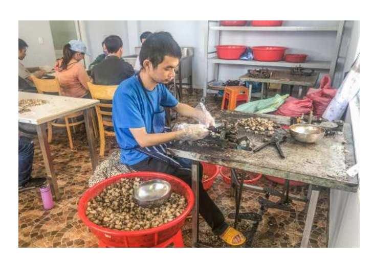
The kernels of cashew nuts are being extracted