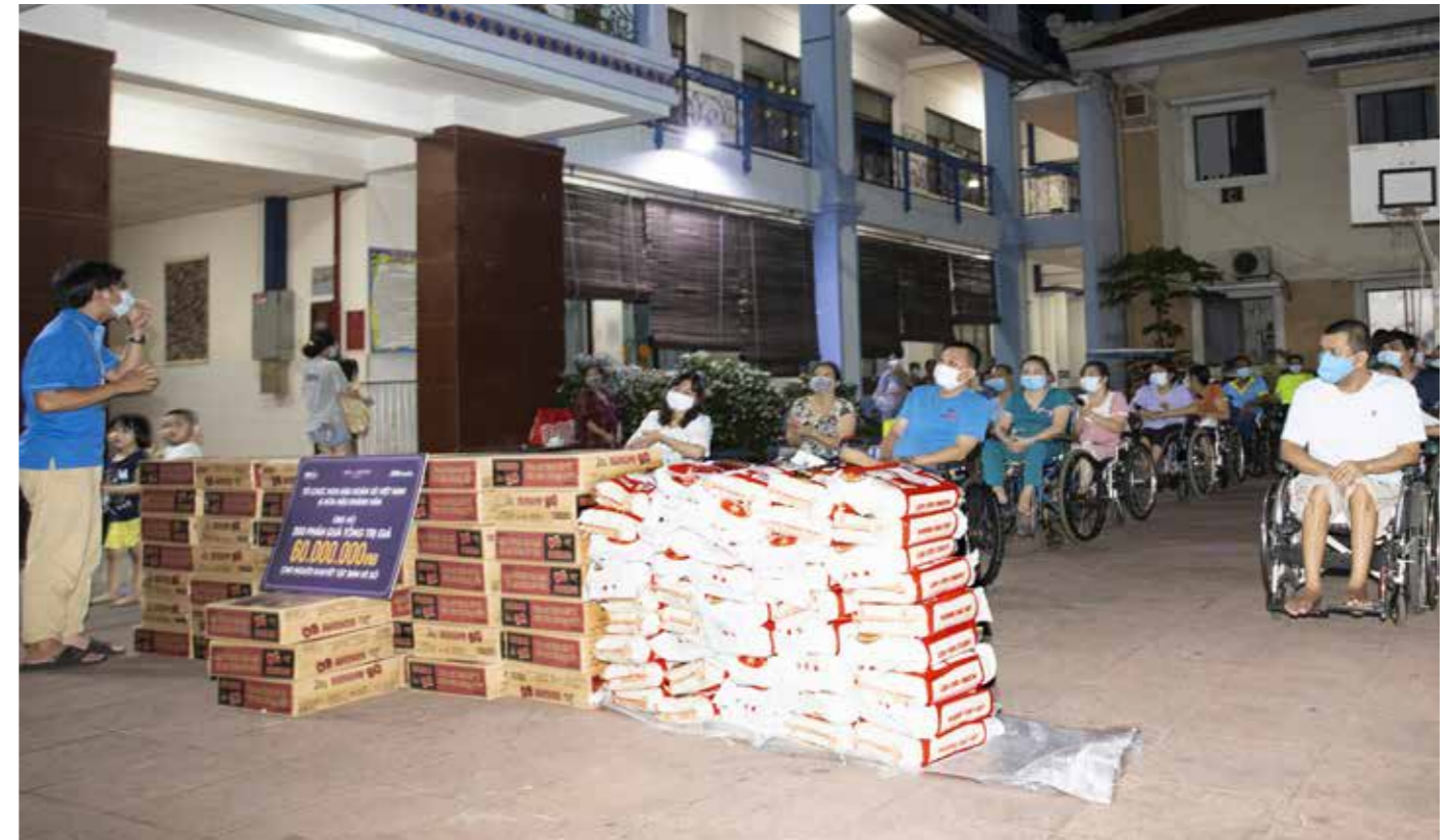
In addition, rice, instant noodles, cooking oil, and seasonings are offered. Thanks to the generosity and assistance of the sponsors, everyone is happy and warm.