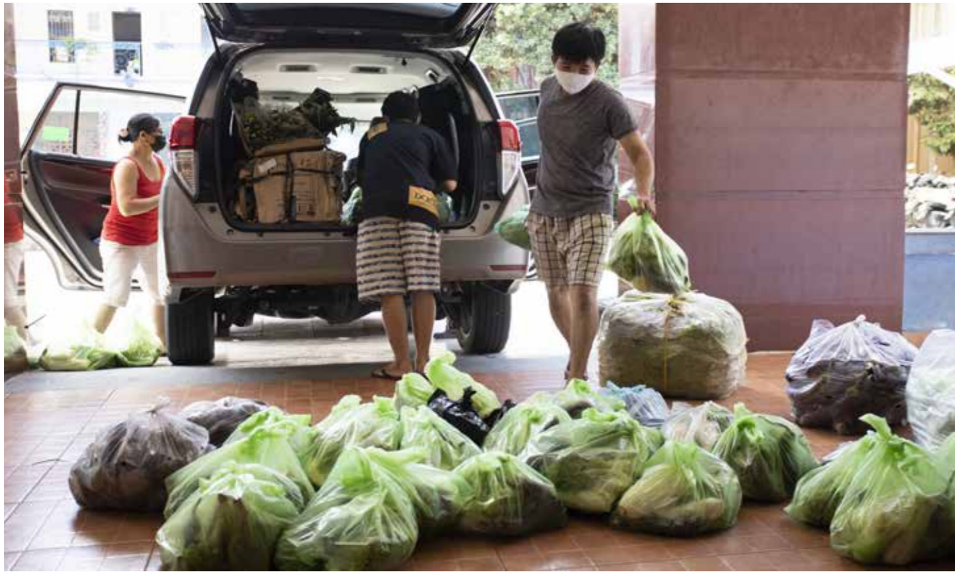
Since the beginning of July, the Village Chance and Shelter beneficiaries received a large number of fruits and vegetables thanks to the generosity of sponsors.