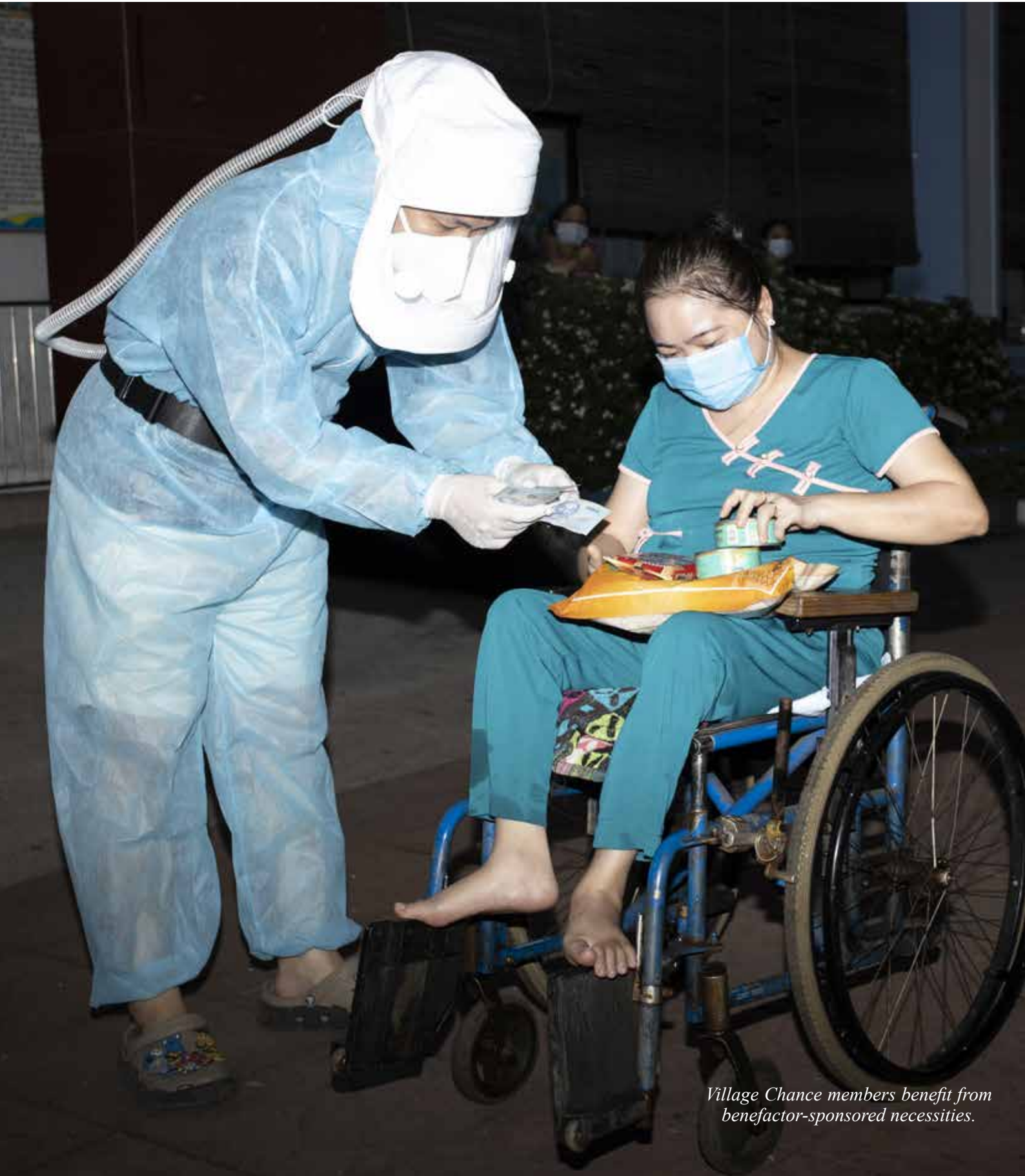
Village Chance members benefit from benefactor-sponsored necessities.