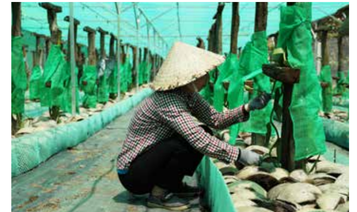
The cultivation of vanilla plants necessitates significant effort and meticulousness.

According to experienced research, weather conditions of certain places in Vietnam are suitable for the growth of this tree. It is the growing areas of elevations under 1000 m above sea level, with not so cold a temperature. When it comes to soil, vanilla trees are often planted in growing media; the area should be shady such as under a tree or minimal greenhouse.