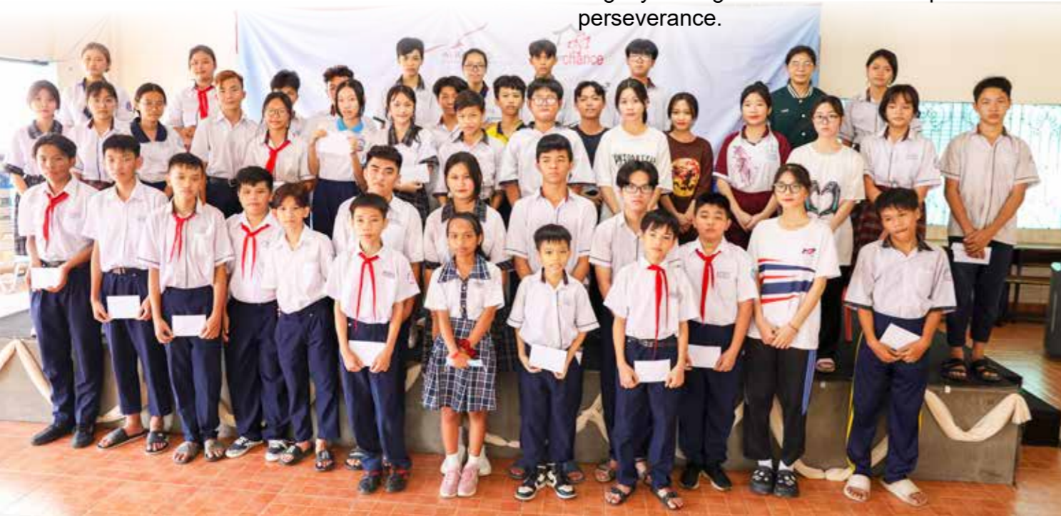
Students from disadvantaged backgrounds continue to receive scholarships from Maison Chance after completing their primary education.

Taking to heart that knowledge is the key to changing one's life, Maison Chance not only takes care of the children during their time studying at Maison Chance, but also accompanies them in the long run. By supporting them to the fullest, Maison Chance ensures that the children, who were not born under lucky stars, can still shine brightly through their incredible capabilities and perseverance.