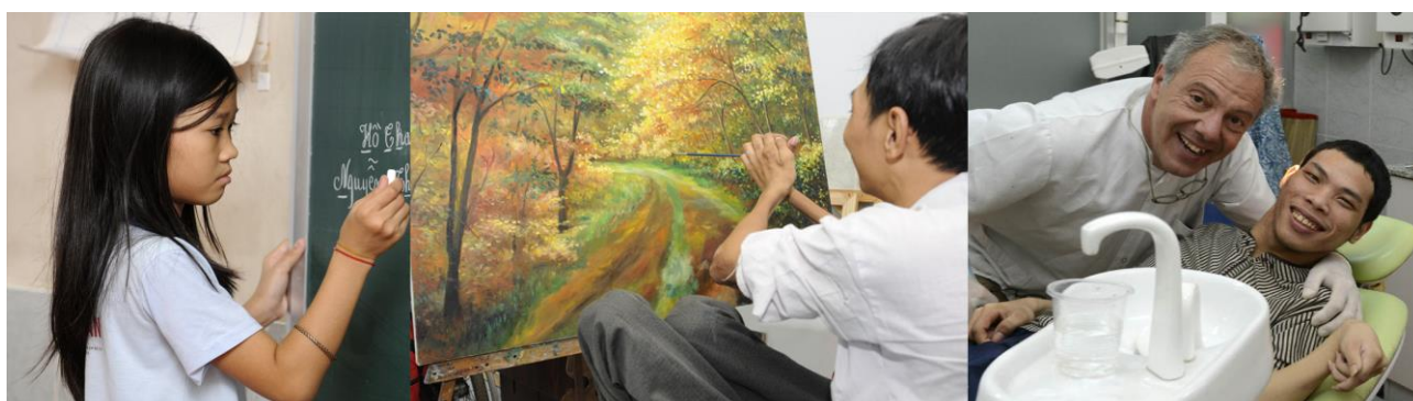
SOCIAL CENTER MAISON CHANCE IN HO CHI MINH CITY

The Project Office searches for new sponsors and follows up with the donors. Maison Chance continues to develop its project in Dak Nong province and ensures the monitoring of the programs in Ho Chi Minh City.