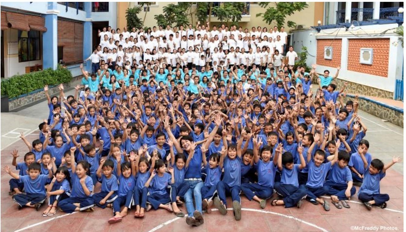
The Maison Chance family with the employees (white), volunteers (turquoise), the disabled beneficiaries and all the children (blue).