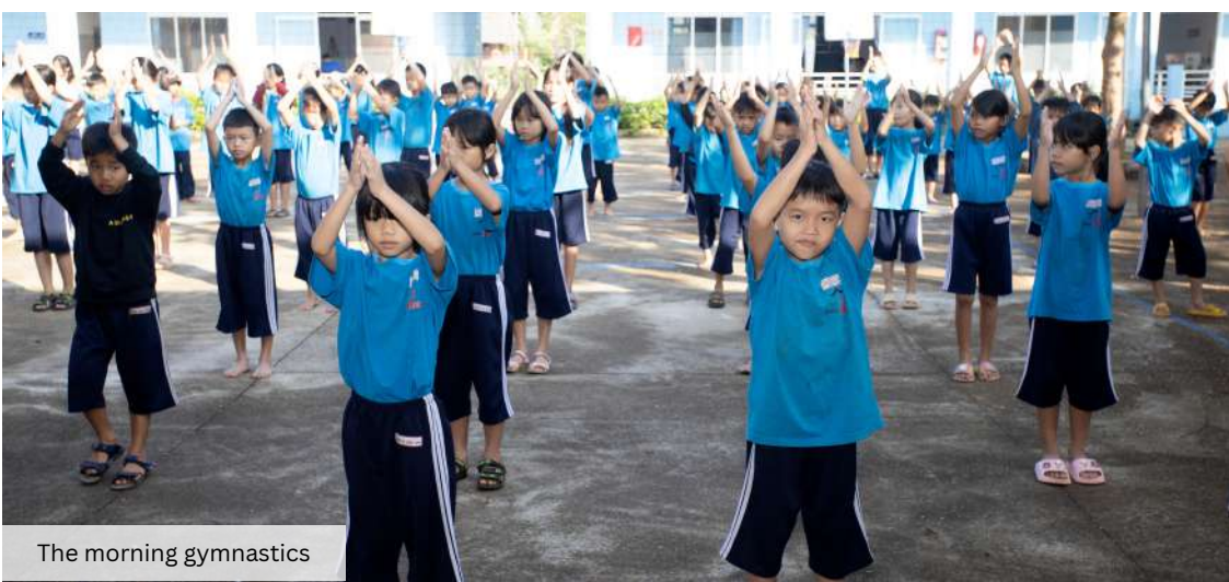
The morning gymnastics

25 adults with disabilities work and learn in the vocational training rooms.