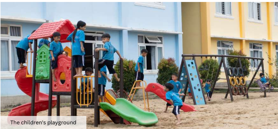
The children's playground

In 2022, the Maison Chance social center in Dak Nong province, located in the central highlands of Vietnam, helped 259 beneficiaries.