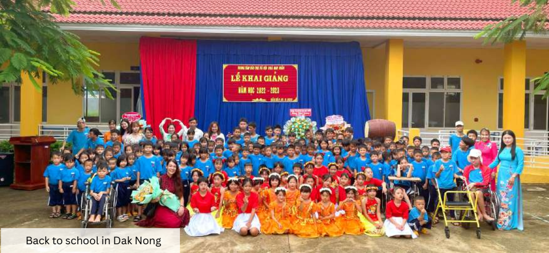
Back to school in Dak Nong