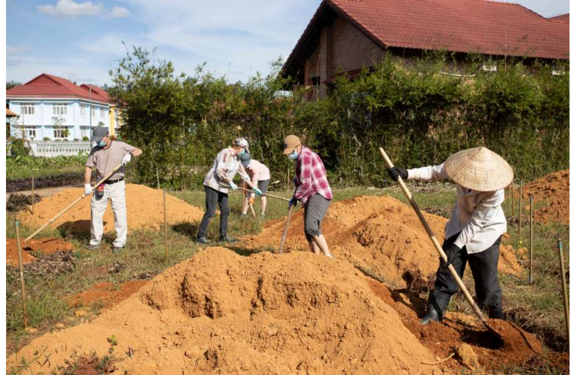
Tourists have returned to Dak Nong where they can visit beneficiaries and work alongside employees