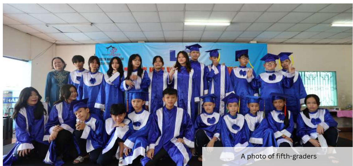
A photo of fifth-graders