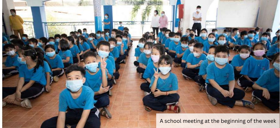
A school meeting at the beginning of the week

3 families in extremely difficult circumstances receive medical care, medication, food, and financial support from Maison Chance, allowing their children to continue their education