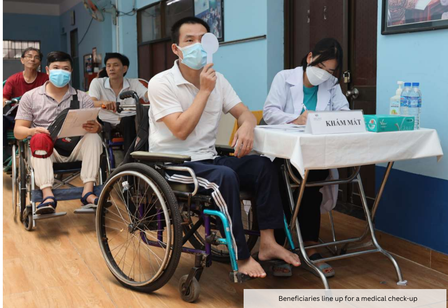
Beneficiaries line up for a medical check-up

In 2022, 83 beneficiaries, including people with disabilities and orphans, received complete medical check-ups.