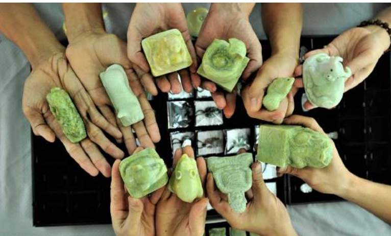
Small statues made by the hardstone carving workshop

For those who wish to pursue independent work or start their own business, Maison Chance offers assistance from the project design phase to its completion, empowering beneficiaries to achieve their goals and take control of their lives.