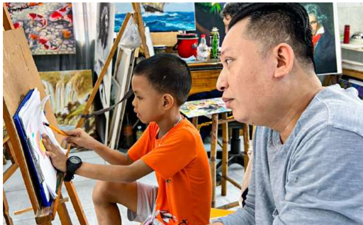
A drawing class given at the Take Wing Center