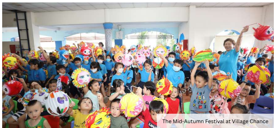
The Mid-Autumn Festival at Village Chance