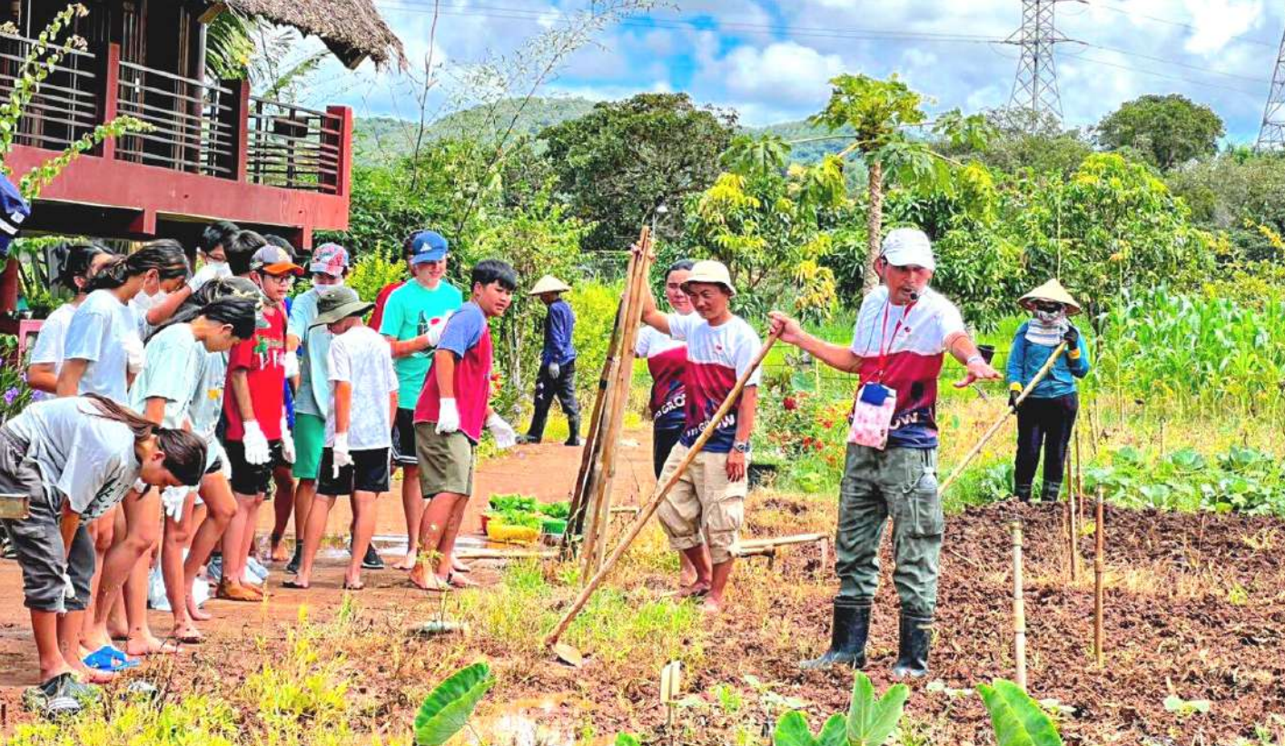
A group of students participate in organic farming in Dak Nong